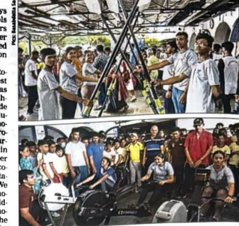
The students from 30 schools will be trained in strength development, endurance and rowing skills at the 30-day camp

Kolkata: Around 152 boys and girls from 30 city schools have enrolled for a summer rowing camp that started off at Rabindra Sarobar on Wednesday.